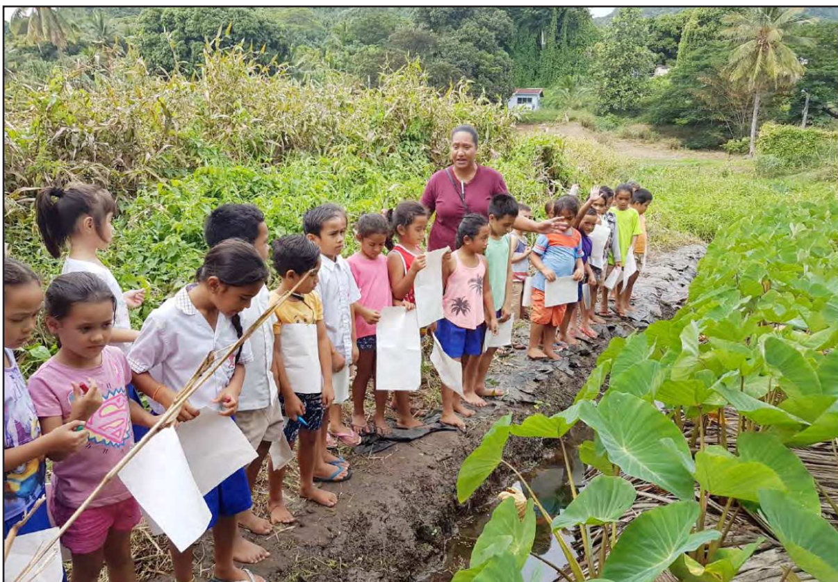
Passing on Traditional Knowledge, Rarotonga.