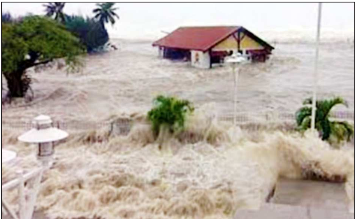
Cyclone Meena, Rarotonga, 2005

More generally, the greatest risk for the Cook Islands lies in not being proactive in meeting the challenge of climate change. Regardless of our response, the changing climate will have an impact on our development, but by our actions we can ameliorate the outcomes. As we implement activities however, we should minimise the social risk of meeting that challenge by approaching it in the manner described in the guiding principles above.