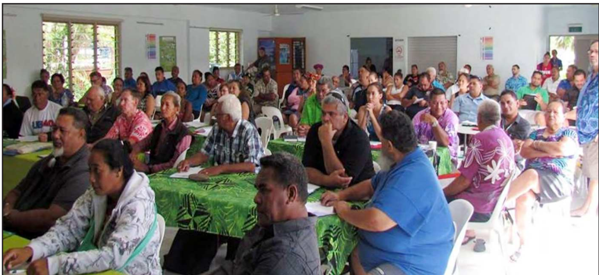
Climate Change Workshop October 2017.

The horizon of the vision is 10 years. After coming into effect, the Policy mid-term review should be conducted in 2023 to assess its application and effectiveness. A sample of climate change activities could be reviewed to assess whether the policy assisted and enabled their implementation. A full review should be conducted after the full 10-year period based on the policy measures. The Policy will be updated pending the full review and continue for a further 10 year period.