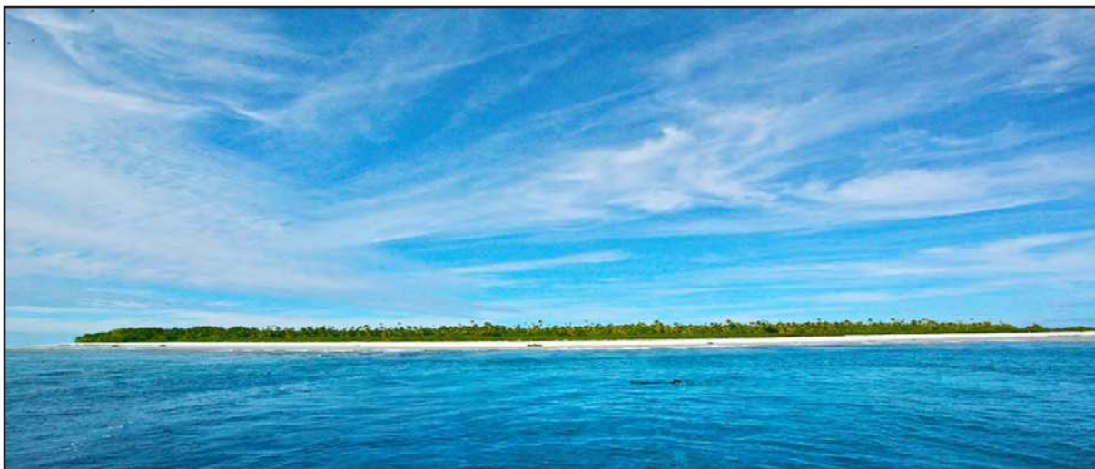
Takutea Island.

The climate in the Cook Islands is generally categorised as an oceanic tropical climate. The Cook Islands is prone to range of both natural and man-made hazards with the most common being cyclones and droughts due to our position on the cyclone belt and the current El Nino conditions.