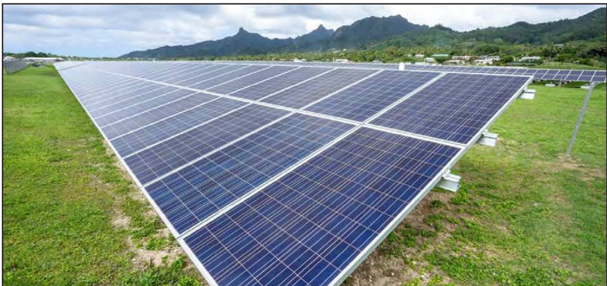
Solar Plant, Rarotonga Airport.