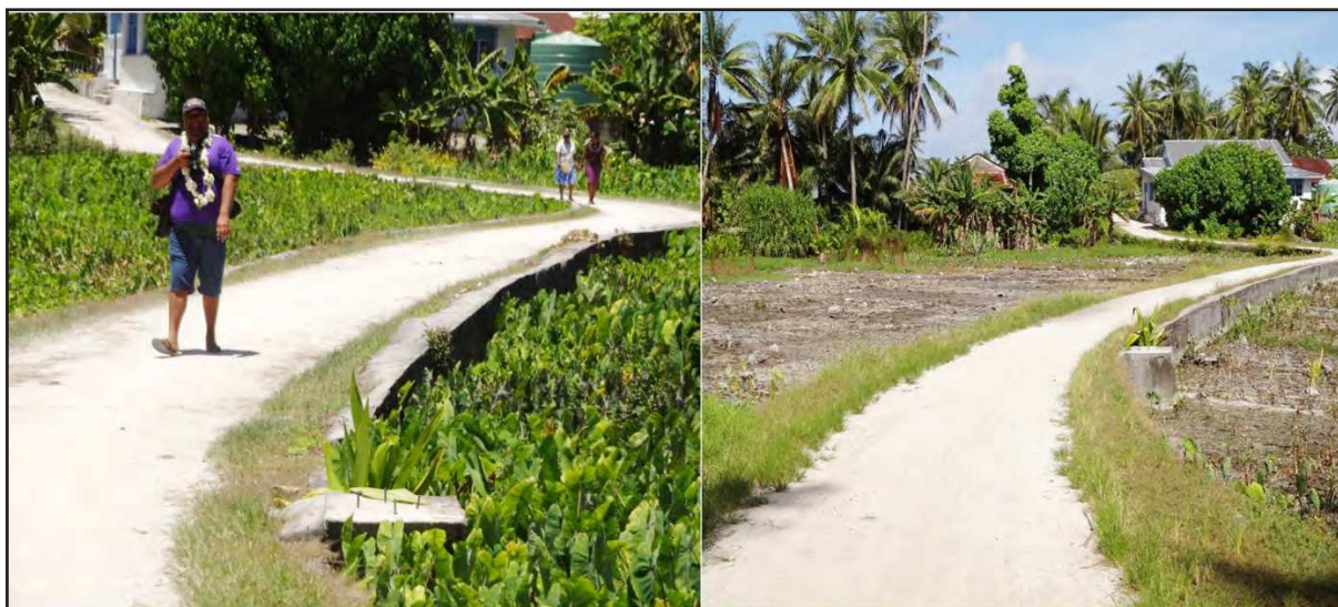
Salt Inundation, Pukapuka.