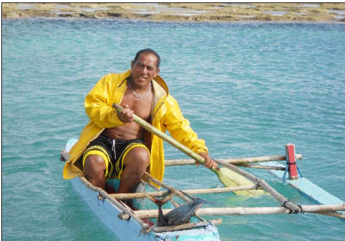
Local Fisherman.