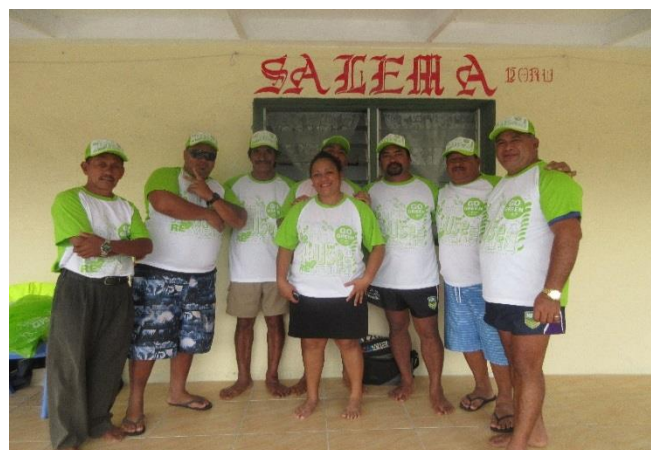
Participants from the islands of Mauke and Atiu for the Marorotu workshop.