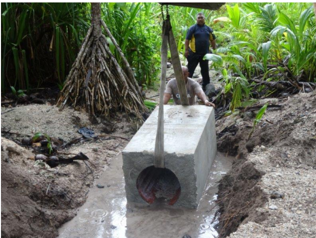
Photo above shows one of the culverts being lifted in position to drain excess water when the taro plantation floods. This project was also part of the SRIC Northern Students workshop outcome, where the students from Pukapuka proposed for fencing around their taro planting area and drainage to prevent further loss of

Pictured above is one of the culverts recently build and ready for transfer to the taro site for installation. Lucky Topetai the SRIC Focal Point worked alongside with the men of Pukapuka in constructing the culverts.