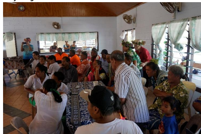
Watching and listening intently to the food demonstration Strategic Planning Retreat 26/28 July