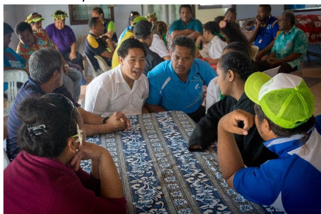
Intense participation and contribution by young and old in the team challenges.

The Raurau Akamatutu workshop was condensed to two half days rather than the four half days previously held in Mangaia. It was packed with team challenges as teams figured out the links between climate change and their daily lives and household activities.