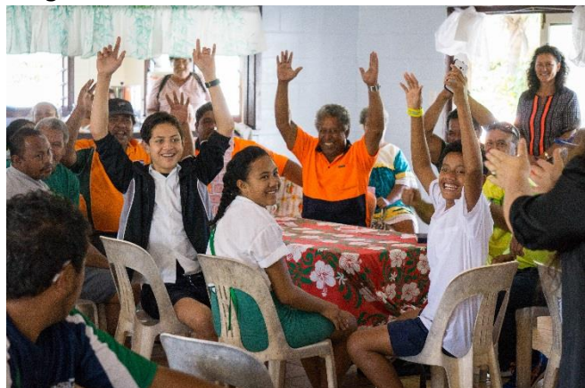
Winning team of the Raurau Akamatutu challenge

The students of Mitiaro were equally proud along with the whole population of just over two hundred that such a historical occasion took place on their island because of them. Well done Mitiaro School and congratulations!