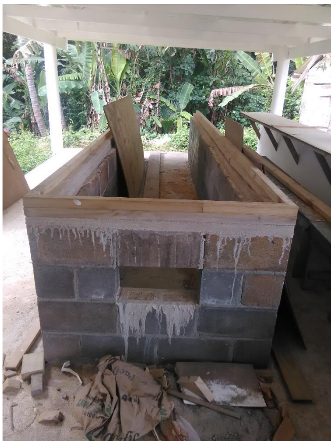
Atiu cold press coconut oil project progress to date

Mia Teaurima the SRIC Project Coordinator was recently in Atiu to check on the progress of projects including the cold press coconut oil project. The building for the coconut project has been ready since April, leaving the oven to be completed. According to Mia, 'this is the delay in the project, we are waiting for the stainless steel top for the oven to arrive'.