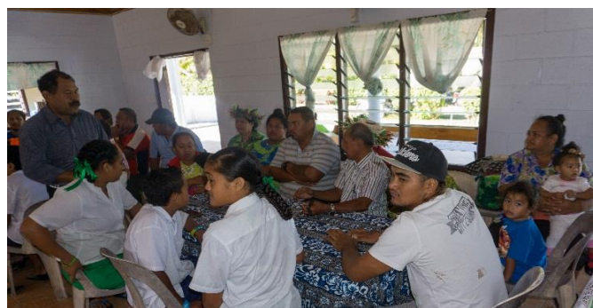
Students and the Community participated in the Raurau Akamatutu and Maroro Tu Workshops.