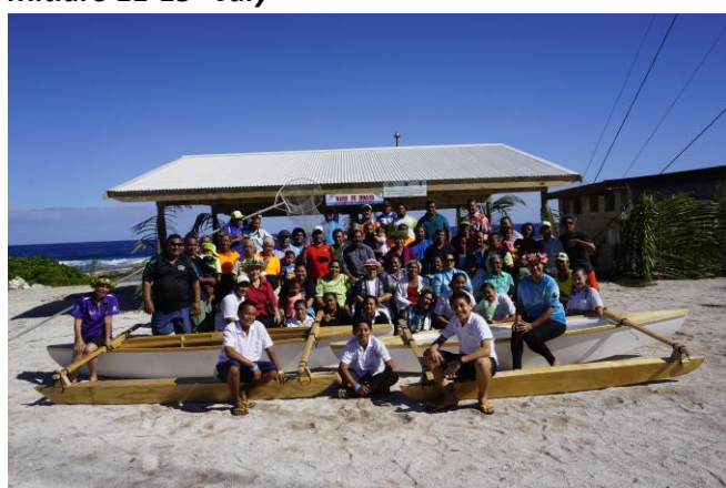
Rere Tu Moana vaka shelter in Mitiaro 11 th July