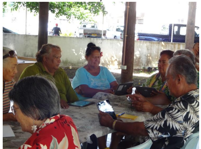
Senior citizens on Rarotonga learning to use the tablet 28 th April-2 nd May