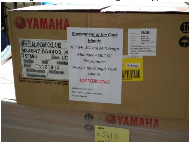
Five outboard motors sitting at Avatiu harbour ready for shipment to Rakahanga 20 May 2014

Finally, the long awaited outboard motors for Rakahanga has arrived and waiting to be shipped.