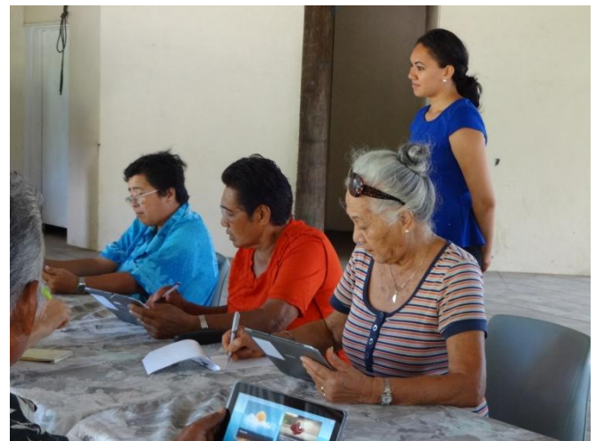
Participants at the Rarotonga Rauti Para tablet training which was held at Te Atukura grounds 28 th April – 2 nd May 2014