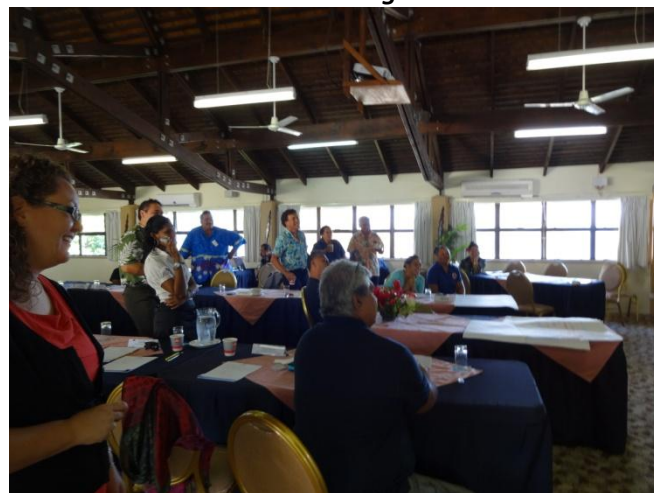
Participants at the training held at the Edgewater Resort 19-20 June.

Wednesday 19 June saw the inaugural of the disaster risk reduction training course offered by the Pacific Disaster Risk Training Programme. This is a three day training workshop sponsored by SPC, The Asia Foundation and USAid which was hosted by the Office of the Prime Minister's Emergency Management Cook Islands (EMCI) division. Purpose of the course is to familiarise participants with the rationale and principles of risk reduction. The course is tailored to the Pacific way of doing things using