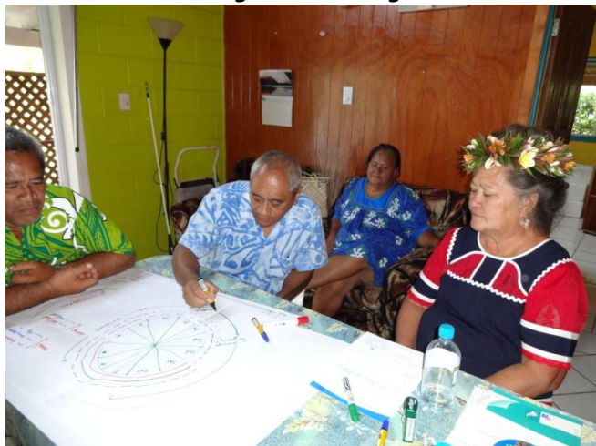
Cook Islands delegates in group work at the workshop 20/6/2013.

The Pacific Centre for Environment and Sustainable Development of the University of the South Pacific (USP) of Suva, Fiji in partnership with the European Union (EU) conducted a community training workshop at the headquarters of the Cook Islands National Council of Women, Rarotonga. Participants of the workshop came from the Polynesian triangle of; Samoa, Tonga, Niue and Cook Islands. The workshop was held from the 17-20 June with a total of 18 candidates. Participating candidates came from varying backgrounds particularly from villages and small islands. The purpose of the workshop was to train community representatives to build capacity to assist with the development of climate change adaptation plans for their respective communities. In doing so, the objective is to strengthen communication skills in delivering appropriate messages to the community using relevant communication tools, to facilitate discussions on adaptation, disaster risk management and the integration of these into action plans for the communities or islands. Workshop delivery method was through presentations and group work. Day 1 looked at communication and communication tools, where each country group was asked to identify the most appropriate and relevant method and tool for delivering messages and communicating with their respective communities. It was interesting to note that some small villages in Savaii, Samoa, still use