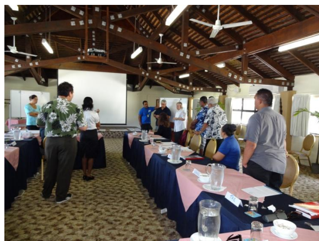
Disaster Risk Training at Edgewater Resort