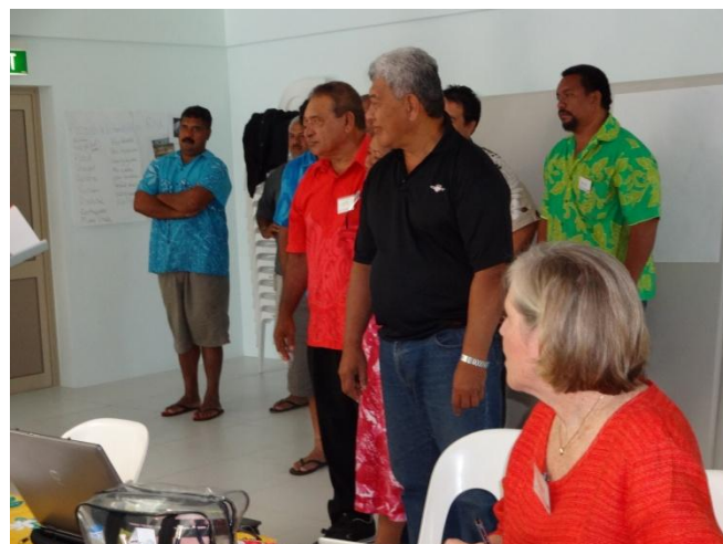
Participants at the Disaster Evacuation workshop, Red Cross 24-25 June 2013.