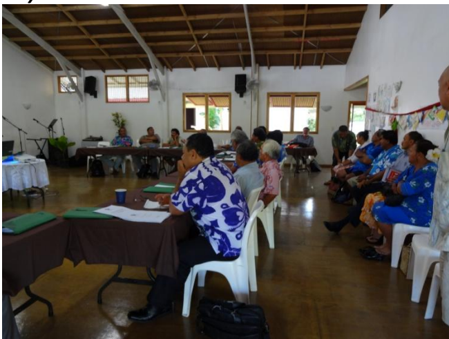
Mayors with Executive Officers from the Pa Enea at the workshop 17-21 June 2013.

Mayors and Executive Officers from the Pa Enea congregated on Rarotonga from the 17-21 June to undertake a familiarisation workshop with the new