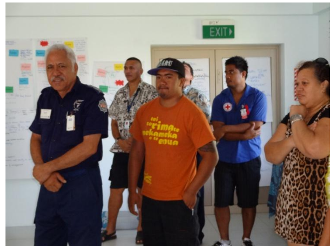
Participants at the Disaster Evacuation workshop- Red Cross 24-25 June 2013 (Picture provided by Celine Dyer).

The Disaster Evacuation workshop is the second phase of the Disaster Risk Reduction workshop previously held last week. In this instance participants were introduced to the principles of safety evacuation in times of disaster.