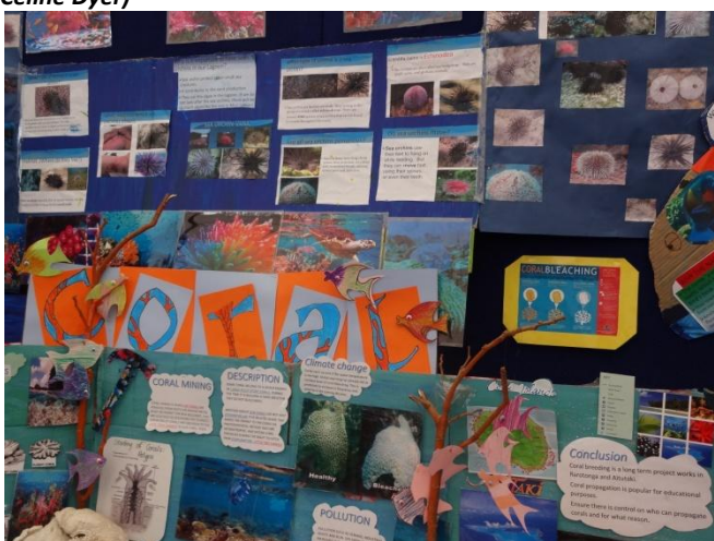
Nikao School focused their display on corals