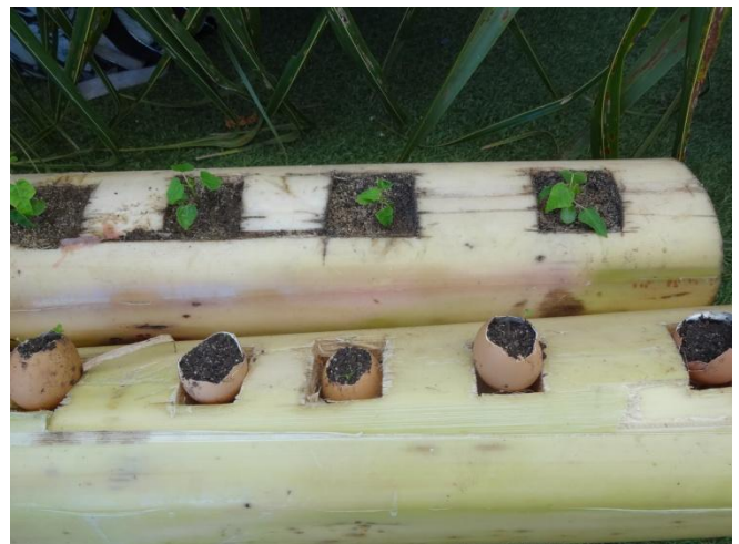
Banana trunks with egg shells to grow seedlings

Some interesting ideas from the displays above include using banana trunks to grow seedlings and even to plant herbs. Keeping it green all the way!