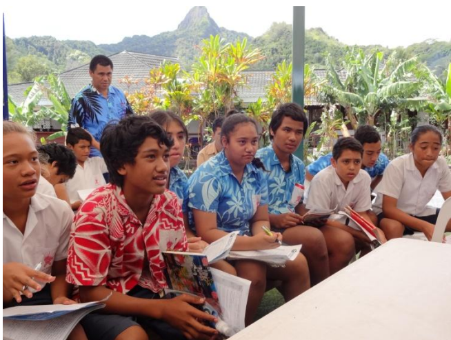
Students very much in touch with their environment