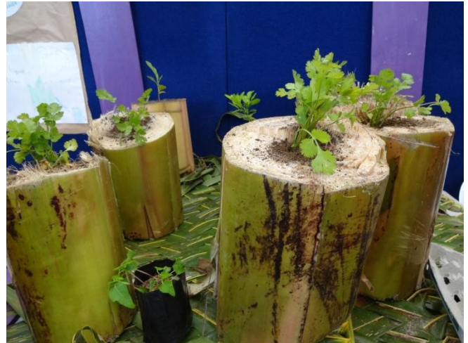
Novelty ideas from the school and community displays