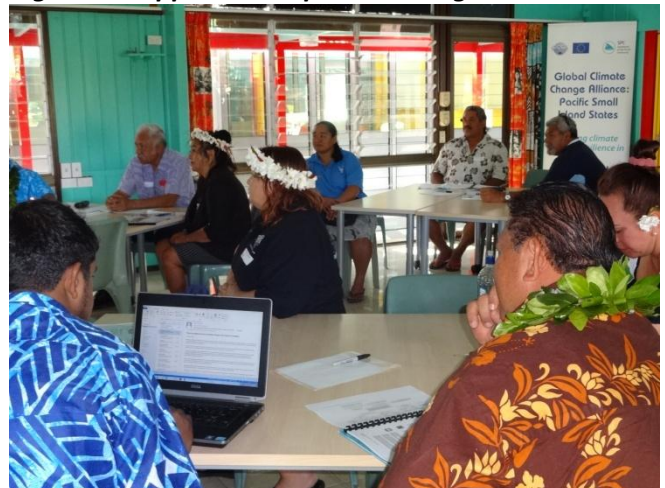
Participants at the opening of the workshop 19Oct

The workshop kicked off to a good start with a total of twenty two participants mainly from community groups, non-government organisations, individuals and from the Pa Enua. In the course of the training, participants learned to develop a proposal using the log frame approach, which entailed working in groups thus promoting community collaboration and ownership of projects.