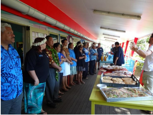
Participants first day of the workshop

were heavily booked on the last two days and were happy they could assist with community organisations put their thoughts into perspective. The workshop was funded by the SRIC CC as a follow up from the 2013 workshop.